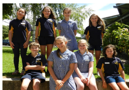
Our 2017 Student Leaders