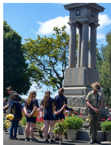
Last Sunday, our student leaders laid a wreath at the Remembrance Day service.