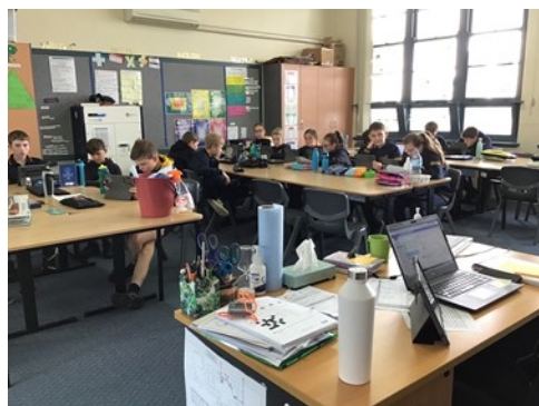
Room 12 undertaking a reading project.