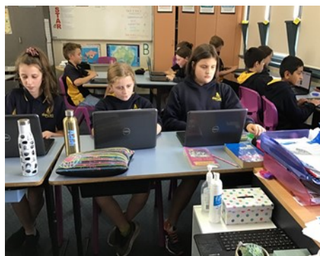
Room 8 students coding on the laptops.