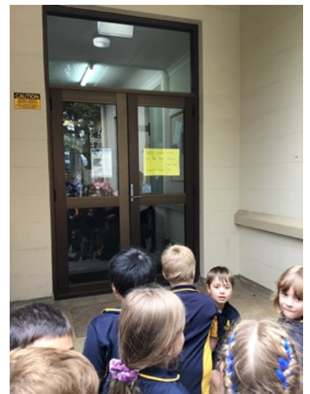
This use to be the front entrance to the school.