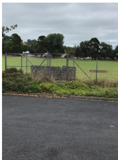
The gate that use to be opened to play on the oval.