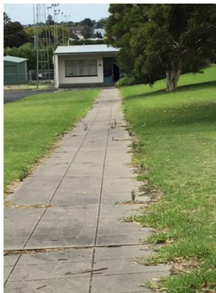
The old junior primary school, which is now the Reidy centre.