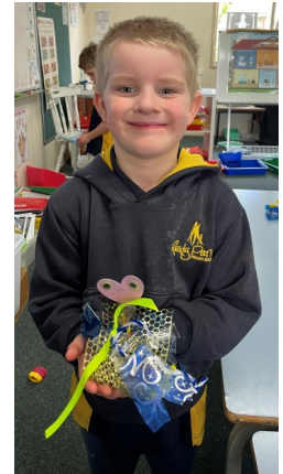
On Tuesday Michelle chose the book – “No Never”. Lotus pods were used to creation Emotion pods.