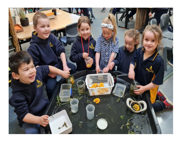
Students from Room 24 having a fantastic time mixing up potions during Play is the Way this morning.