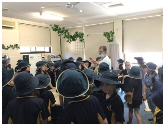
Room 5 use to be a the staffroom.