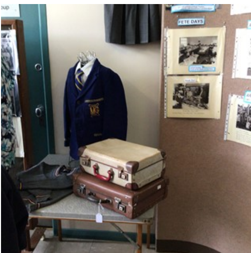
The old school uniform