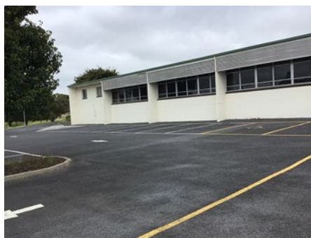
The back part of the old junior primary school. There use to be a small playground here.