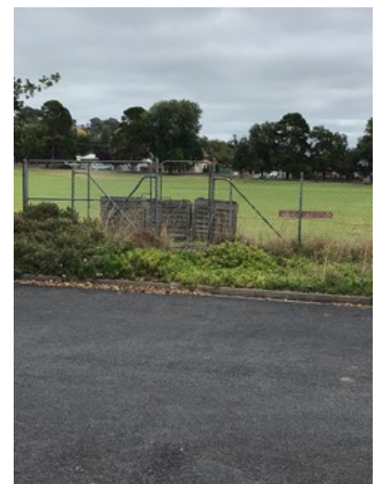
The gate that use to be open to play on the oval.